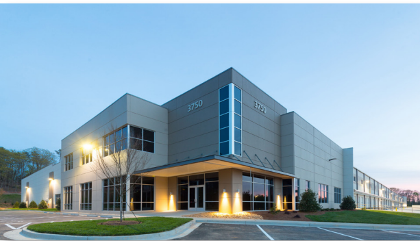
3750 Blue Ridge Drive, Buford, GA 30518