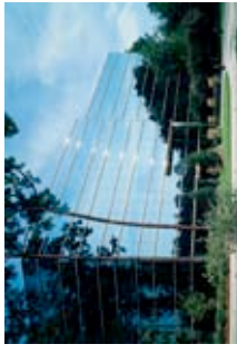
112 & 114 TownPark Drive