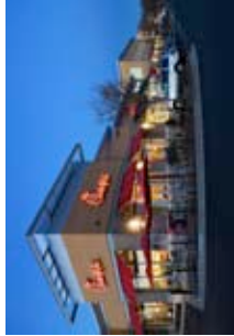
The Village at TownPark