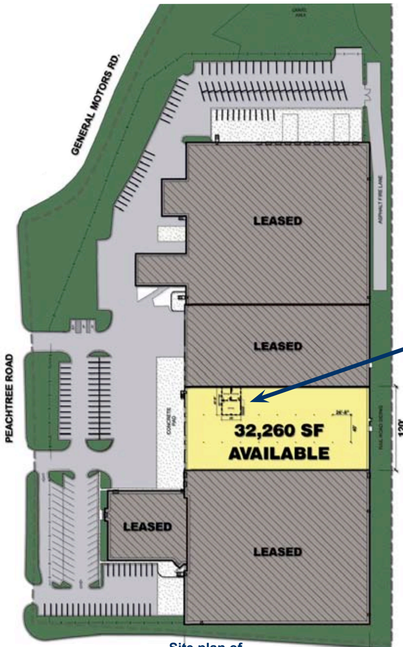
Site plan of 5849 Peachtree Road