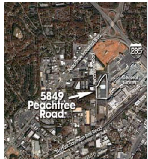
Aerial photo of 5849 Peachtree Road